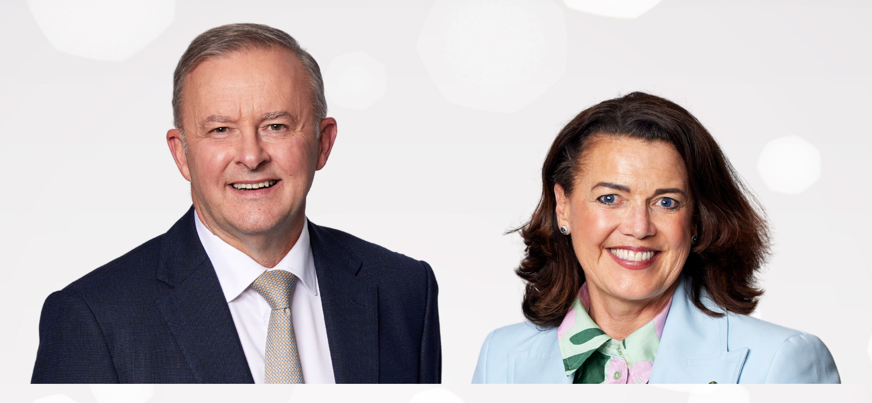
May this Christmas bring joy, peace and a renewed sense of hope.

As we approach the festive season, I want to take a moment to extend my warmest wishes to you all.